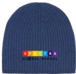
NAVY BEANIE RIBBED HAT WITH SPECTRA LOGO WMB