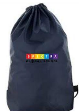
NAVY GYM BAG WITH SPECTRA LOGO EMB