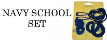
NAVY SCHOOL SET