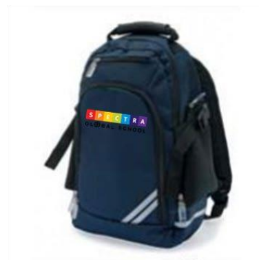
NAVY ACTIVE BACK PACK WITH SPECTRA LOGO EMB