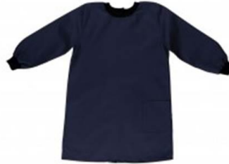
NAVY ACTIVITY APRON