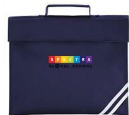
NAVY BOOK BAG WITH SPECTRA LOGO EMB